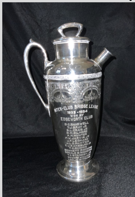
First Trophy dated 1933-1934