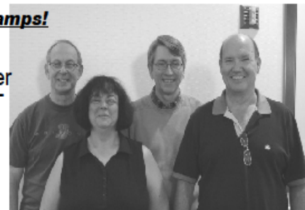
Clearly they practiced with a mirror to look like winners!

The team received $1,000 from District 5 to help defray costs.